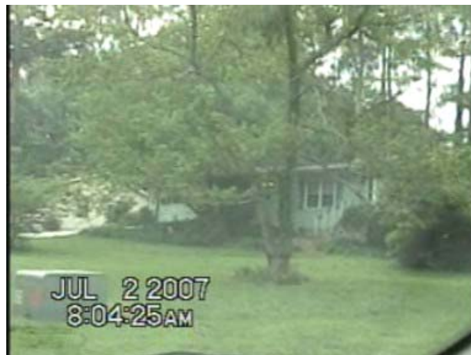
Photo of the claimant's residence

Description of the Claimant's Residence: Best described as a light green wood siding ranch-style house with dark green shutters and white trim. There is a double garage door on the left. The house is set up on a hill, and the back yard is visible from a side street. The yard is well-maintained.